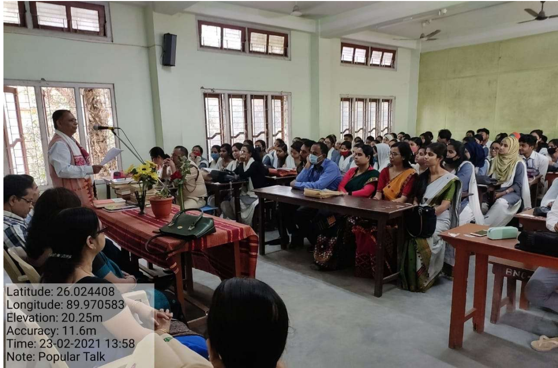
Students and Teachers attending the Lecture Programme